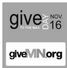
Give to Victory !

Give to the Max day is Wednesday , November 16. On this day, residents have opportunity to donate to ViNA . You were planning to give to ViNA anyway , so why not do it on November 16 . It’s simple! It’s easy! Just log onto www.givemn.org and in the donate box in the