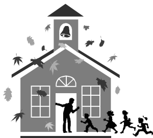
Loring School has a new principal

from St. Mary's University in Min- neapolis. I have such a strong pas- sion for learning and believe that we are all continuous learners. I am an avid gardener and have lived in this community for ten years. Although we have recently moved to the Uptown area, I still have such strong connections to the North Side. I am a strong believer that all kids can and will learn at a high level. I love the saying, smart is not what you are it is something that you be- come. I truly feel that statement holds true for all of the Loring stakeholders. I look forward for the opportunity to continue the tradi- tion of academic excellence here at Loring as well as establishing a strong partnership with the greater community.