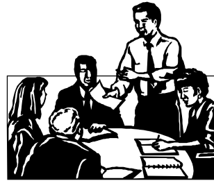
The ViNA Board has 4 new directors