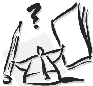
Census takers are needed.

That is why it is critical that everyone in the state, city and neighborhood be counted. North Minneapolis is historically one of the most UNDERCOUNTED areas in the City and the State, which is why the U.S.Census Bureau wants to hire people to work as census takers in their own neighborhoods .