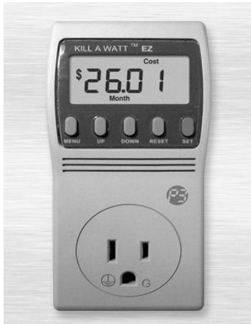
ViNA has 4 Energy Meters for residents' use

Also, many electronic devices, rechargers, and appliances draw power even when they're switched off or not in use, and though it may seem trivial, this "phantom load" can add up to between 5 and 20 percent of the energy use of a typical household. This increases our energy bills, but also increases demand on our electrical power stations and transmission grid. It is a