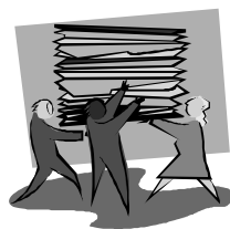
Helping hands are needed

The mission of the Victory Neighborhood Association is to protect and promote neighborhood interests and the health, safety and general welfare of its residents. But with only one part time staff person, most of the work is done by volunteers. Make it your new year resolution to be one of those doing the work of the neighborhood association.