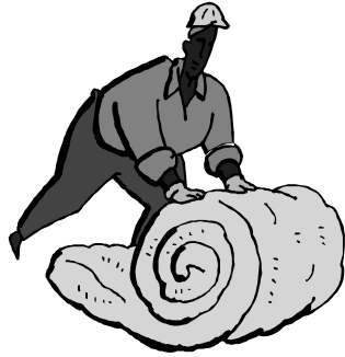
Insulation qualifies for a rebate.

Minnesota Federal Stimulus rebates of up to $10,000 are available through the Minnesota Housing Fix-up Fund in the form of an "Energy Saver Rebate." The "Energy Saver Rebate" offers a 35% rebate for all qualifying energy improvements. These qualifying improvements include windows, doors, insulation, water heater, heating and cooling. Improvements