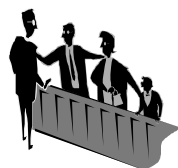
Join the ViNA Board of Directors