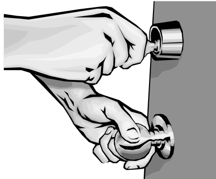
Rebates are offered for home security improvements

One of the goals of ViNA is to build a community where all people feel safe. With this goal in mind, ViNA is launching the Home Security Rebate Program. The program reimburses Victory Neighborhood residents or property owners for improvements that will enhance the safety of the property they own or reside at. Property may be defined as streets, alleys, yards and dwellings. All Victory residents whether