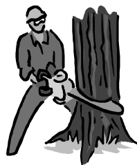
MPRB will replace your boulevard ash tree now.

The EMERALD ASH BORER has been identified in ash trees in Minneapolis. The EAB attacks all true ash trees; green, black, and white ash. The fatality rate is 100%. 21% of the Minneapolis tree canopy is ash, including 38,000 on the boulevards. 400 are in the Victory