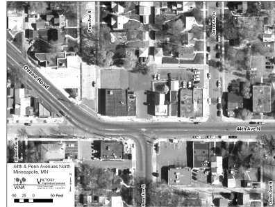
44th and Penn and Osseo Road intersection

In December 2007, ViNA was awarded a $20,000 grant to conduct a pedestrian needs study for 44th and Penn and Osseo Road. In April 2008, ViNA selected Wenck Associates from among three reputable firms that had submitted a proposal to complete the study. Since then, the Business Committee has been providing active oversight of the study, including arranging for input from area businesses and residents. A few preliminary recommendations to