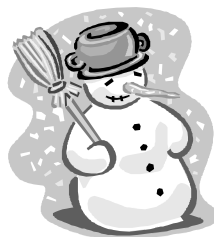
Holiday on 44th and Holiday Lights

Before we know it the cool breezes will turn to cold winds, the fall rains to icy snow and holiday activities will be upon us. Prepare now to enter the annual Victory Holiday Lighting Contest. Nominations and judging of Holiday lighting displays